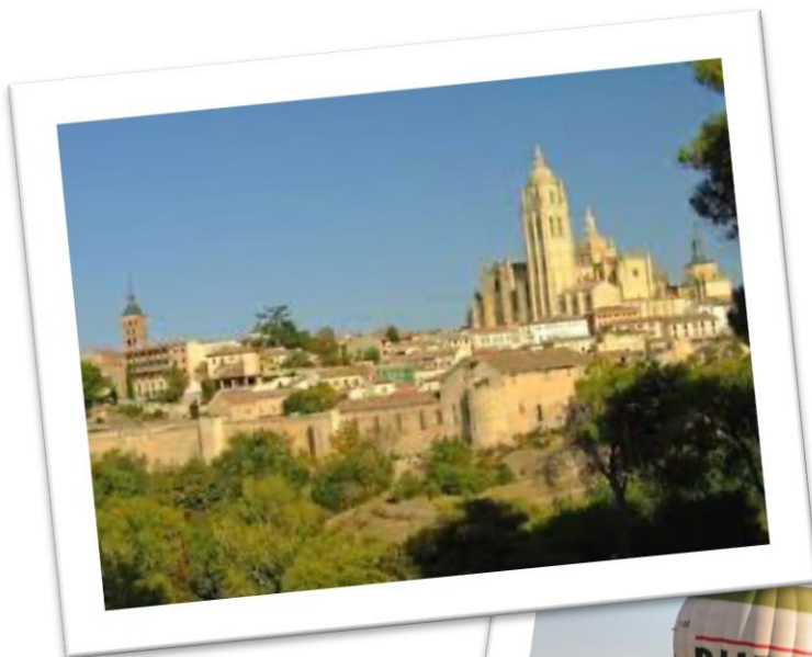
The views from El Pinarillo